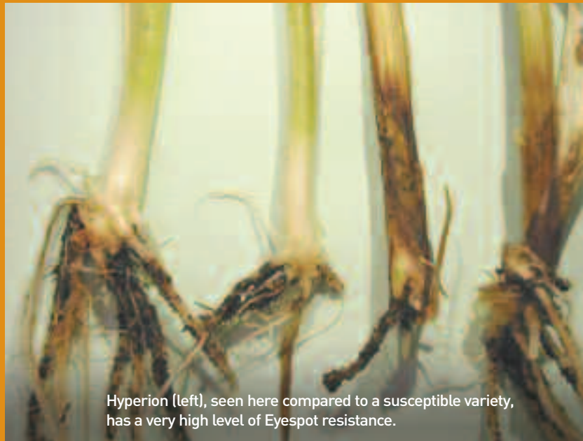
Hyperion (left), seen here compared to a susceptible variety, has a very high level of Eyespot resistance.